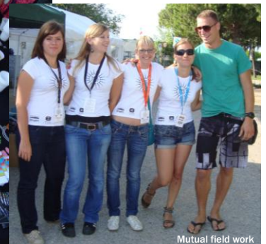
Mutual field work